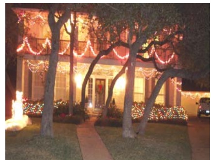
Bruce and Sharon Walker 4829 Eagle Feather Honorable Mention 4609 Canyonwood Honorable Mention 4700 Travis Country Circle