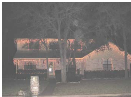
Richard and Dianne Cardiel 4500 Twisted Tree Cove Honorable Mention: 4706 Trail Crest Honorable Mention: 4400 Sacred Arrow