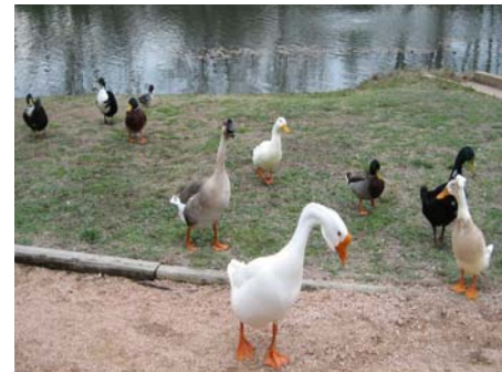
The two geese (front, center) can be very aggressive. Residents should exercise caution around them.

As most of you know, the geese at the BV pond were given to us; one from TC homeowners, the other, from the notorious "Anonymous" (who has contributed ducks as well.) These geese have become a bit aggressive; especially since the arrival of the white one.