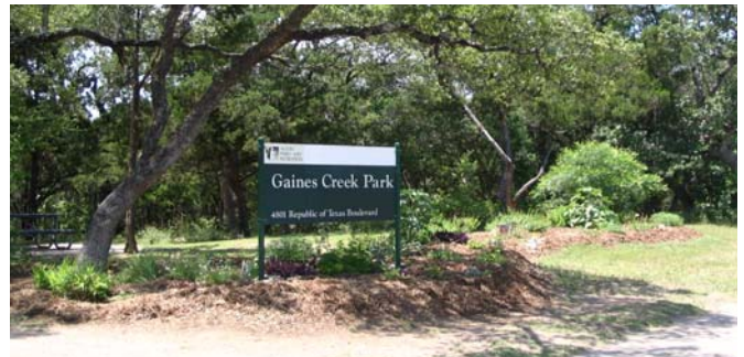
The new 420 sq.ft. bed of plantings at the front entrance to the park

Thanks to many resident friends of the park for donations of over 100 plants. A 420 square foot park bed was created and completed with 56 volunteer hours. Monthly upkeep of the park bed will continue throughout the summer as other park projects get underway. Spring seasons will be especially colorful with many native and adapted plants in bloom. If you would like to volunteer, please email bluesky2u@austin.rr.com . We need someone with a chainsaw to cut out dead wood in the creek bed.