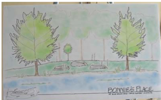
Conceptual drawing of Memorial site